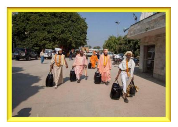
Media Coverage on Shree Maharajji's Departure to Divine Abode